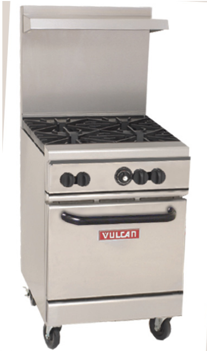
Model 24-S-4B-N (shown with optional casters)